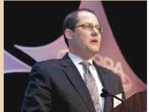
Senator A.J. Wilhelmi