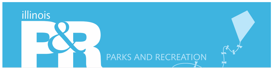
— Rachel Laier, Editor

211 East Monroe Street, Springfield, Illinois 62701-1186 217.523.4554 FAX 217.523.4273 iapd@ilparks.org www.ilparks.org www.IlIpra.org