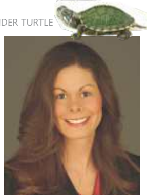
RED EARED SLIDER TURTLE

This is one of the most exciting issues of the year! It is packed with great stories, award winners of all kinds and the ever-popular Legislative Platform . Not to mention, the feature requested by many of our members – ‘Going Green.’